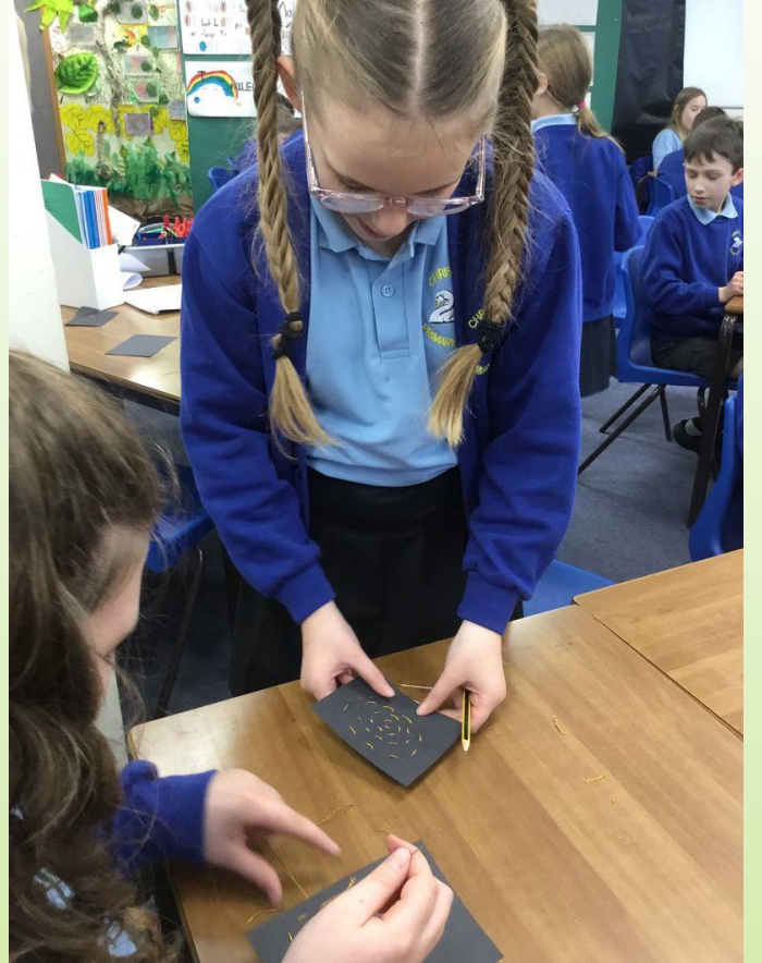
The children experimented with stitching techniques.

Using the class book, Year 5 used a variety of drawing techniques in their sketchbooks to rebuild buildings and landscapes that the war had destroyed.