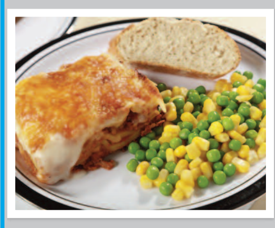
Beef Lasagne served with Garlic & Herb Bread and Seasonal Vegetables