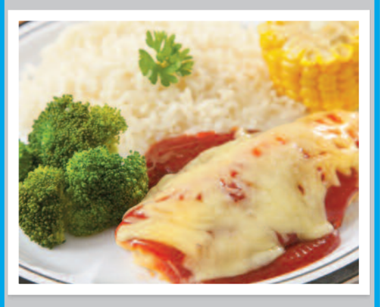
BBQ Chicken served with Savoury Rice and Seasonal Vegetables

Roast Chicken served with Roast/Mashed Potatoes, Seasonal Vegetables & Gravy