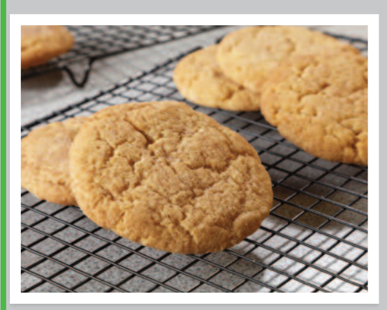
Snicker Doodle Biscuit

Jacket Potato with a Selection of Fillings Served with a Side Salad