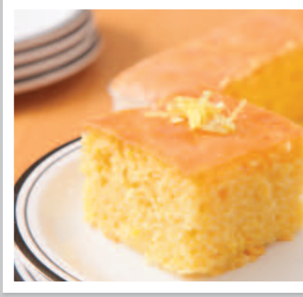
Lemon Drizzle Cake

AVAILABLE EVERY DAY – UNLIMITED SALAD, FRESHLY BAKED BREAD, FRUIT YOGHURT & FRESH FRUIT PLATTER. FOR ALLERGEN INFORMATION, PLEASE ASK ONE OF OUR CATERING TEAM. ALL THE ABOVE DISHES ARE SUBJECT TO AVAILABILITY.