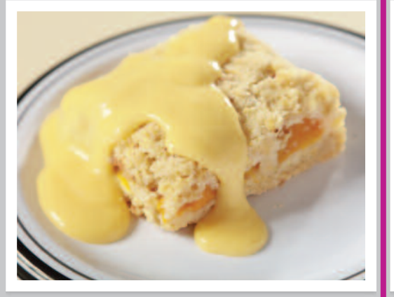
Peach Crumble Slice & Custard