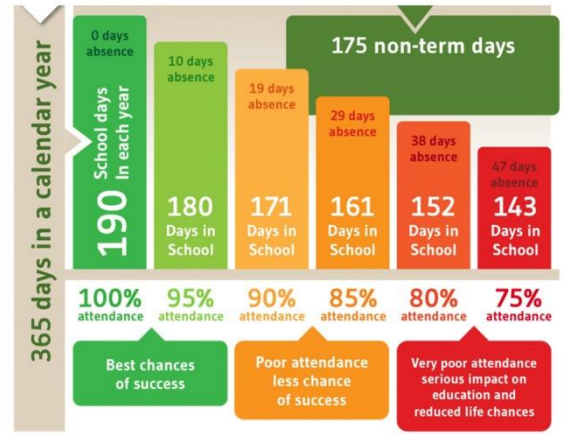
DID YOU KNOW? A two week holiday in term time means that the highest attendance you can achieve is 94.7%